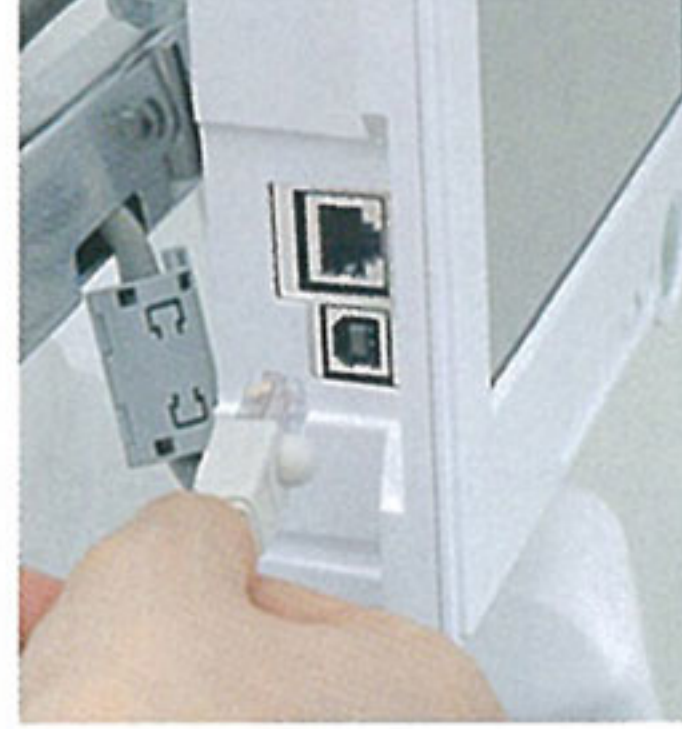
LAN/USB Connection Ports For optional live PC connection for design transfer/setup/management