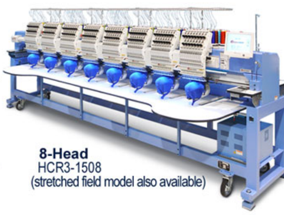
8-Head HCR3-1508 (stretched field model also available)