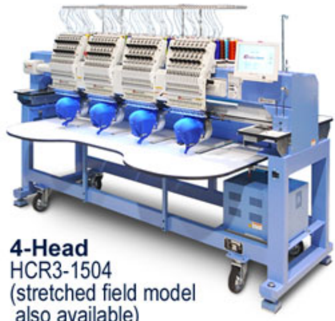
4-Head HCR3-1504 (stretched field model also available)