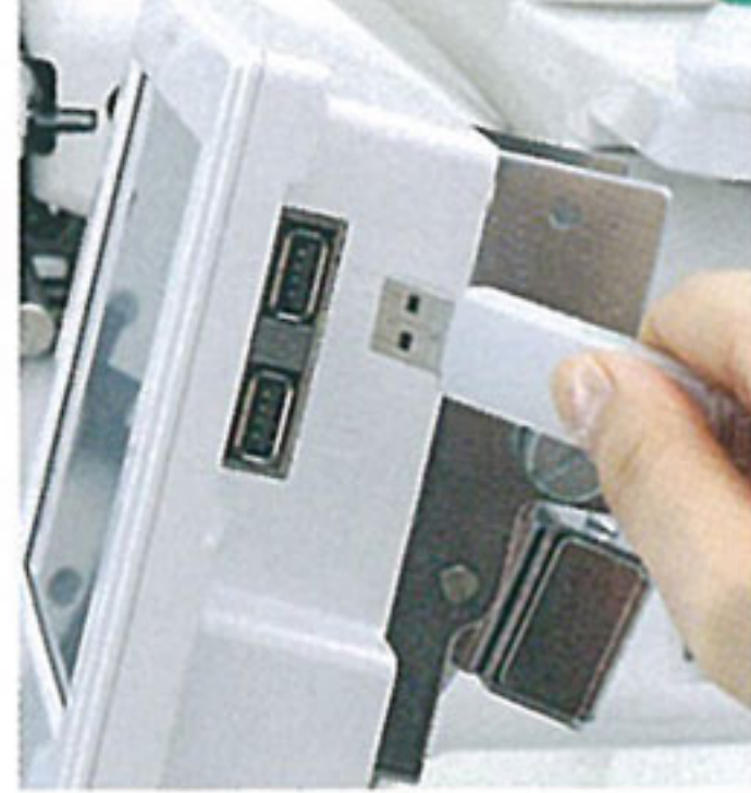
Dual USB Ports Accept most brands/capacities of USB thumb drives, USB mouse