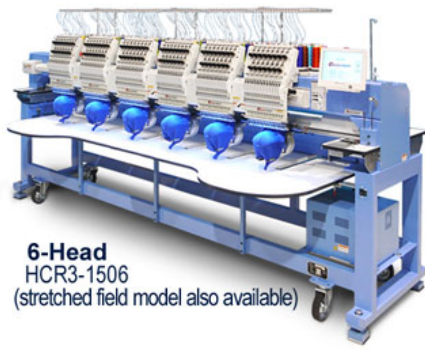
6-Head HCR3-1506 (stretched field model also available)