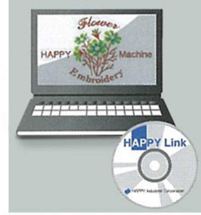
Included HAPPYLINK & LAN Machine networking, design transfer and editing software