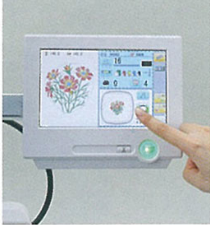
Touchscreen Control Panel Memory capacity: 999 designs/ 40 million stitches. Auto-error correction