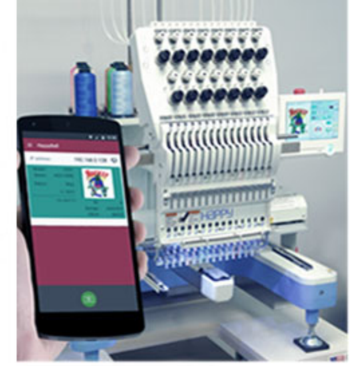
HAPPYBELL Application For monitoring machines wirelessly on mobile devices